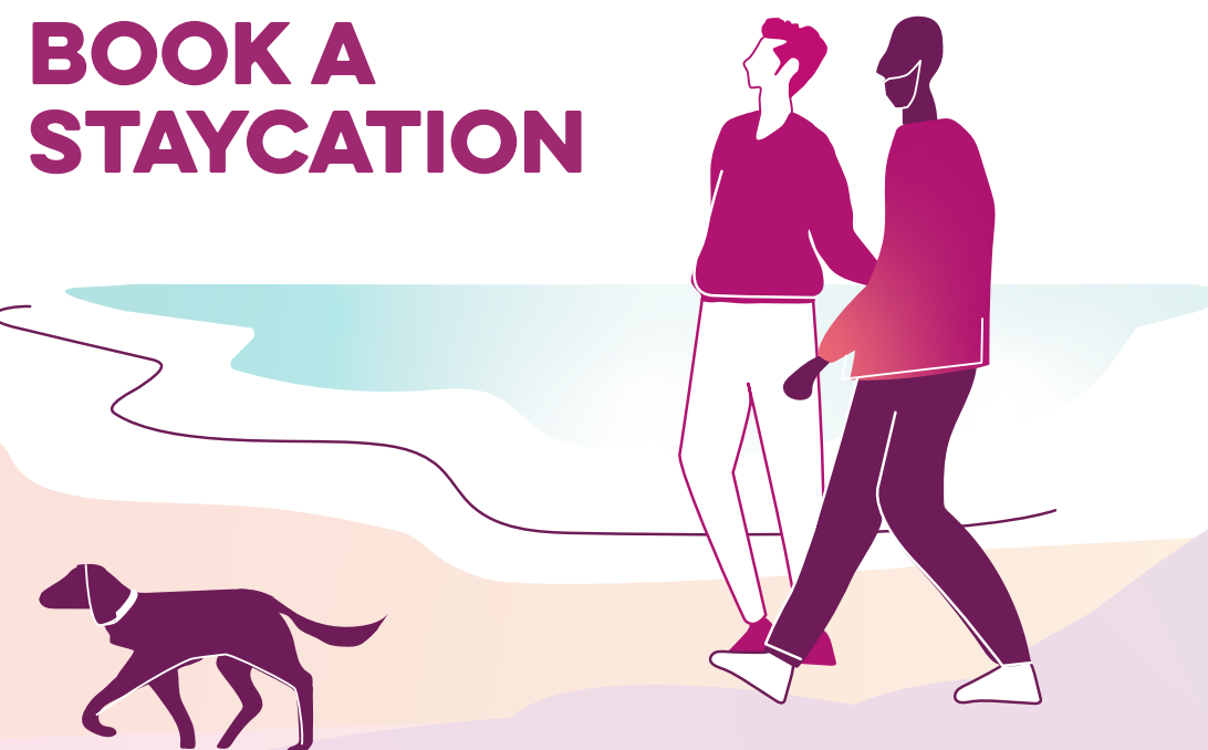
BOOK A STAYCATION