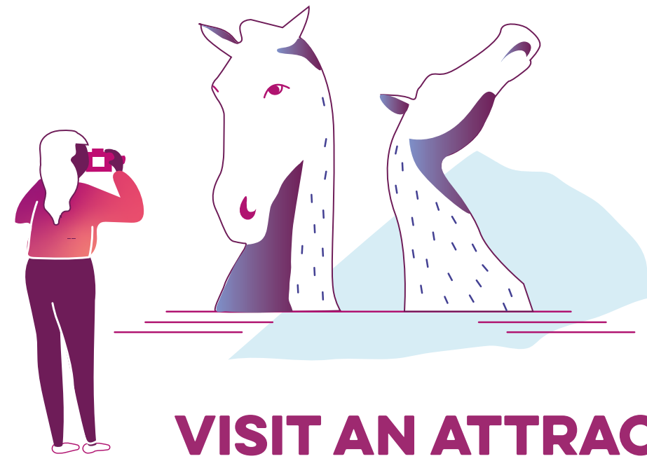
VISIT AN ATTRACTION OR EXPERIENCE

As we start to venture out again, here are five easy ways you can support our fantastic tourism industry