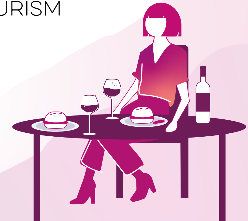
ENJOY A MEAL OUT OR RAISE A GLASS TO TOURISM

ARRANGE A DAY OUT, VISIT SOMEWHERE NEW, REDISCOVER WHAT'S ON YOUR DOORSTEP.