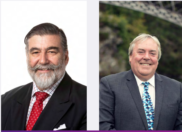
Chair The Rt Hon. the Viscount Thurso